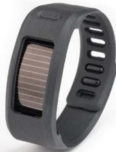
Alta Devices Solar Cells Integrated into a Wearable Device. (Demonstration Only)

Note: Numbers are for the Alta Devices single junction solar cell under AM 1.5G standard test conditions.